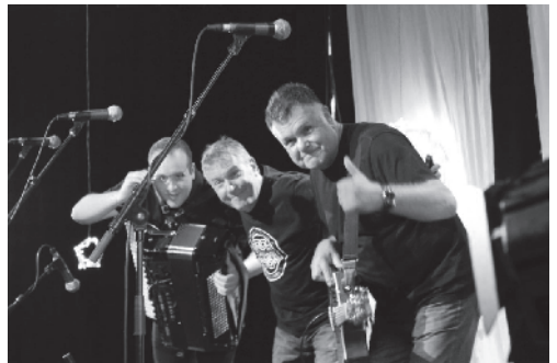
The Happy Cats

Priced £25, the tickets are cheaper than the cost of taxi ride to and from the Charnwood at Blyth on New Year's Eve!!