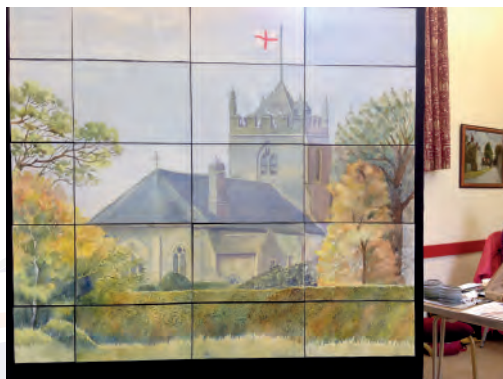
New Mural at Letwell Village Hall - See story inside find

"I don't know what's going to happen because the whole deanery is going through a re-organisation at present."