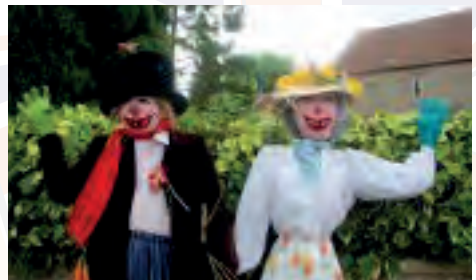
Scarecrows takeover village