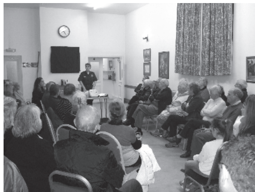
Villagers learn all about the new De-fib

"We don't know how often it's going to be used - but the de-fibrillator would only have to save one life to pay for itself many times over."