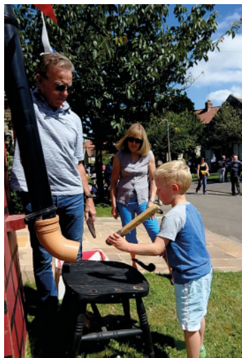
Splat the Rat at Letwell Street Fayre See Full Report Inside

It's finally going to happen! FLAG has learned from BT that the high speed broadband age is heading our way at long long last.