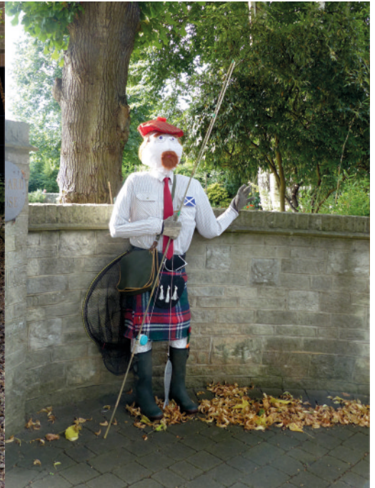
Scarecrow time last year

It will be September before you know it!