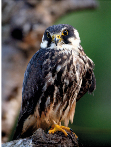
Hobby flies into Firbeck