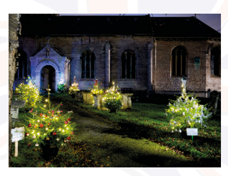
Christmas Tree Festival at St Martins Firbeck

Families living further away are being encouraged by Openreach to take advantage of options provided under the Community Fibre Partnership Scheme.