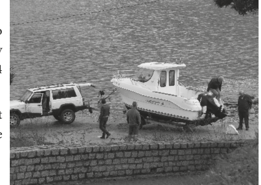
Four Men and a Boat