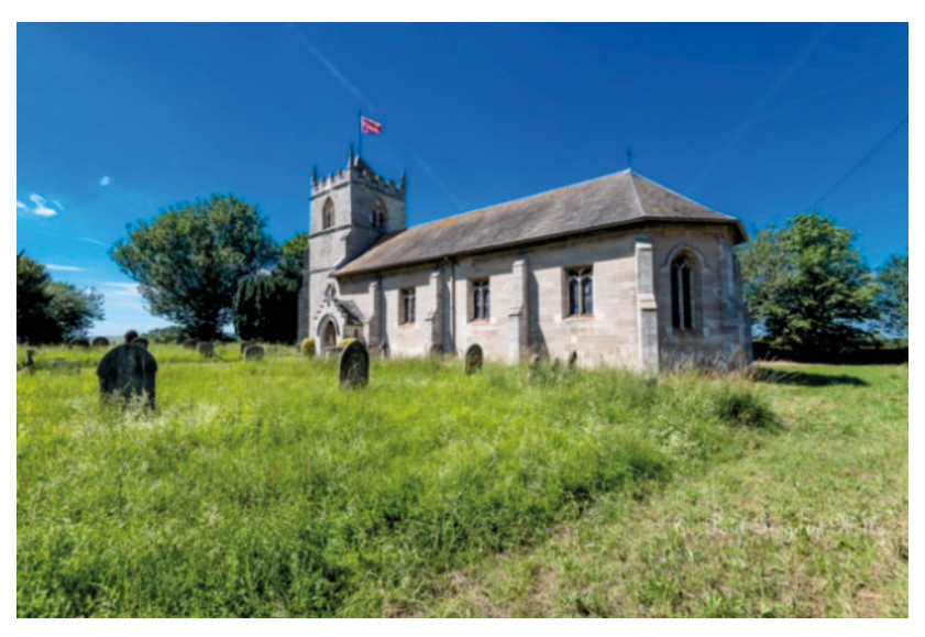
Beautiful new image of St. Peter's Church Letwell