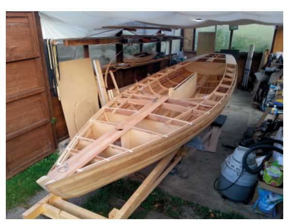
Replica Catboat Lorelei Takes Shape at Firbeck

A chance internet find of line drawings/offsets for this boat were enough to prompt a Firbeck resident to seek working plans/drawings that would allow him to build a replica. He soon discovered that none existed but luck was on his side when a volunteer at LIMM offered to provide detailed photographs and measurements of the original. This was enough to enable some basic plans to be produced and work was started in March 2017 with hopes of a launching this year.