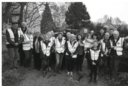
Volunteers gather for the Firbeck litter pick