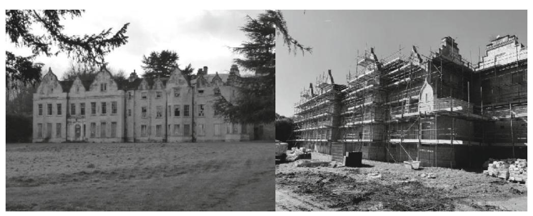
Looking forlorn in 2017

Sid Ellis was delighted: "It's probably the best news of all," he said. "It means the roof will be in place before the worst of the winter weather, and the continuing work can proceed."