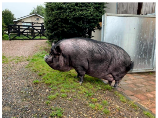
Twigglet safe at Letwell

Due to her unconventional start in life she won't entertain proper pig food and prefers pizza and Chinese. Hopefully we can find her a more appropriate home once the 21 day movement restrictions are over.