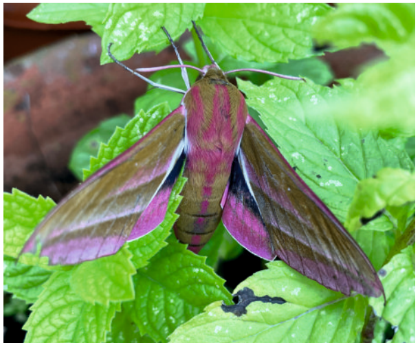
Elephant Hawk Moth