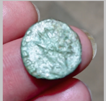
Found in a local field coin 1700 years old

*Doreen tells her own story inside this issue of FLAG