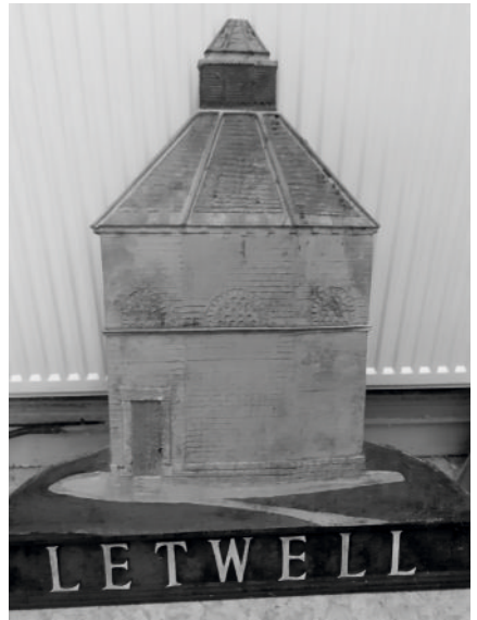
Letwell village plaque

We are looking forward to seeing at the village hall very soon.