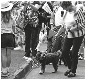
Most handsome dog - Ted