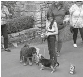
Winner and runner up