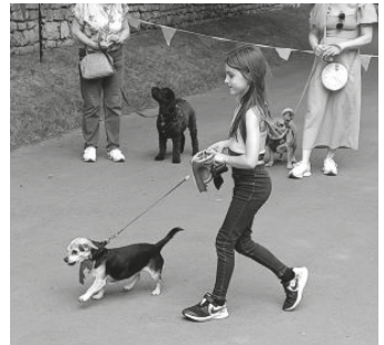
Best in Show