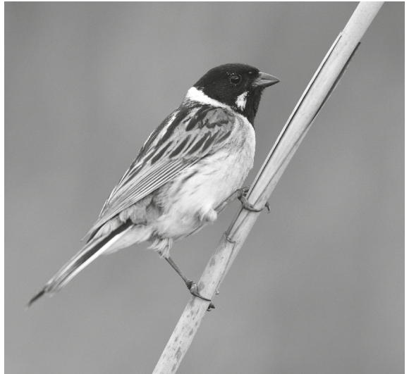
Reed Bunting - A Firbeck Visitor

Now on to the goodies, the highlight being two White Storks seen in Firbeck on 27th April. Wow! These are rare birds in the UK, although they were common up to around 600 years ago. It was probably a combination of factors that led to their extinction here, and their appearance on dinner menus provides a good clue. However, around 20 pairs are now seen annually and a few have bred here in recent years. They winter in Africa.