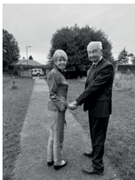
THE HAPPY COUPLE RETURN TO ST. PETER'S