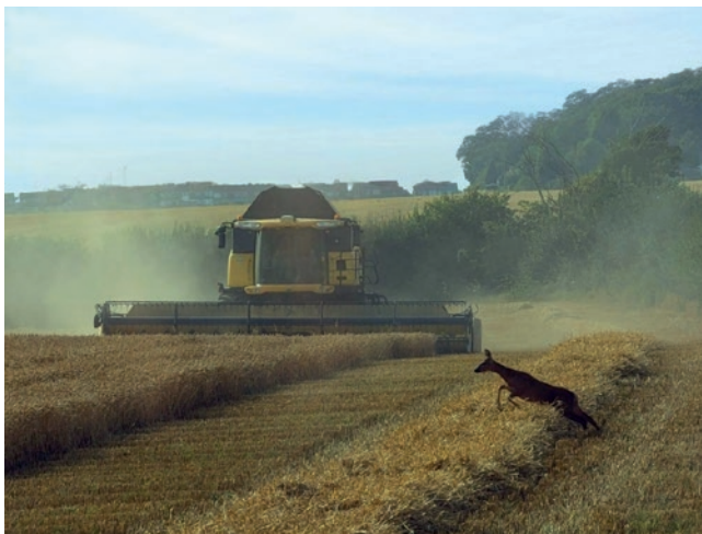
LIA EMMERSON'S REMARKABLE PHOTO OF A DEER STARTLED BY A COMBINE AT GILDINGWELLS

The couple, from South Anston, refused any recompense later on. Well done!!