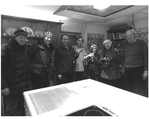
Carollers take a rest at Firbeck's Yew Tree House

Nicky Blyth's Christmas card delivery service at Letwell proved as popular as ever raising £78 for church funds.