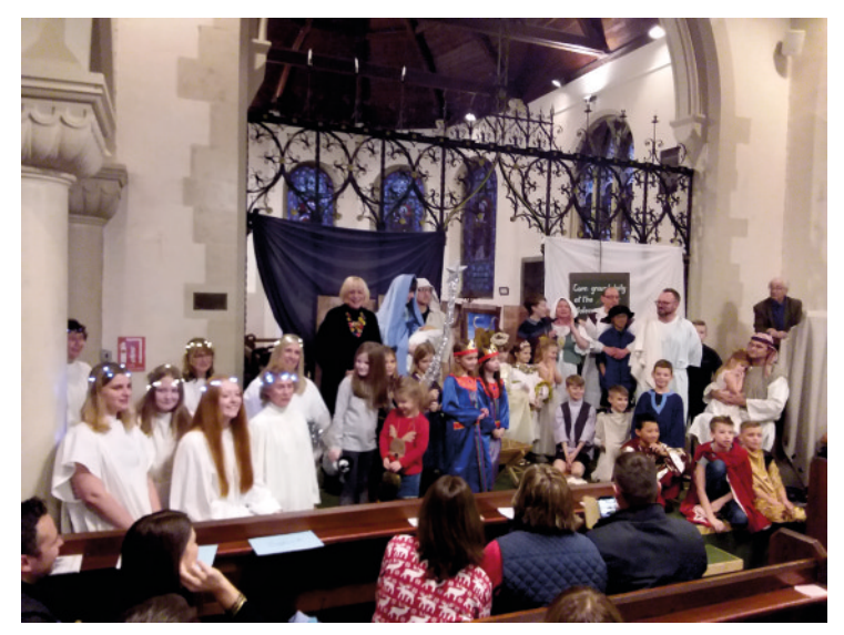
Firbeck Nativity Play