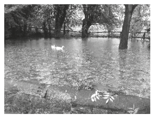
Letwell pond near to overflowing

One told FLAG: "Step into the pond, even when the water level's low, and there's a real danger you'll end up waist deep in the mud.